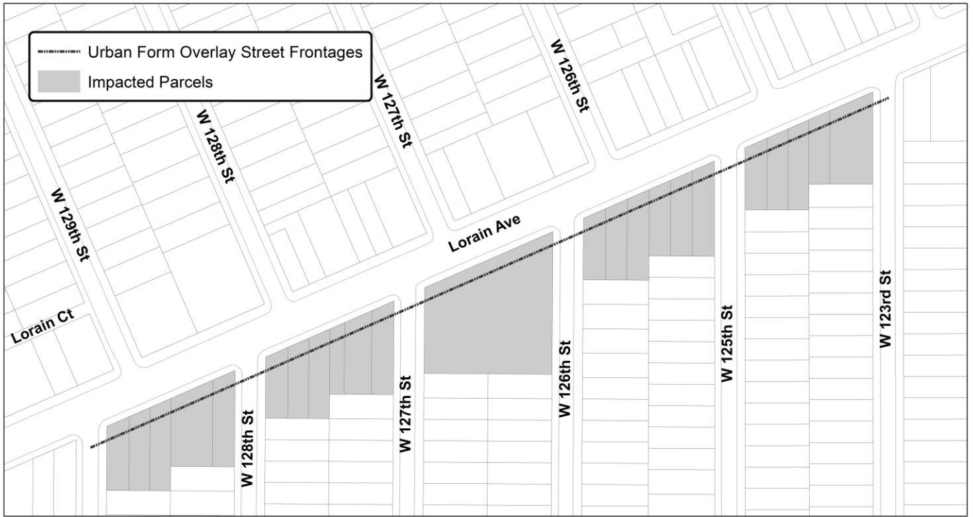
Urban Form Overlay District and Urban Frontage Line Map Change No. 2518